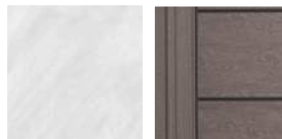
Option 1: Silver Marble/Gray

Vita Spa 100 Series models are available in two color combinations.