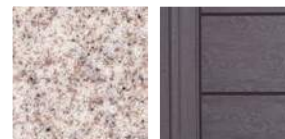
Option 2: Sahara/Mocha