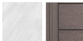
Option 1: Silver Marble/Gray

Vita Spa 100 Series models are available in two color combinations.