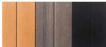
Teak Gray Mocha

Excel-X™ This ecologically friendly, high-impact styrene looks and feels like real, natural wood. It won't weather or stain and is virtually maintenance free.