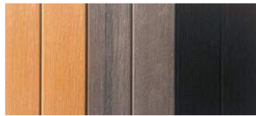
Teak Gray Mocha

Excel-X™ This ecologically friendly, high-impact styrene looks and feels like real, natural wood. It won't weather or stain and is virtually maintenance free.