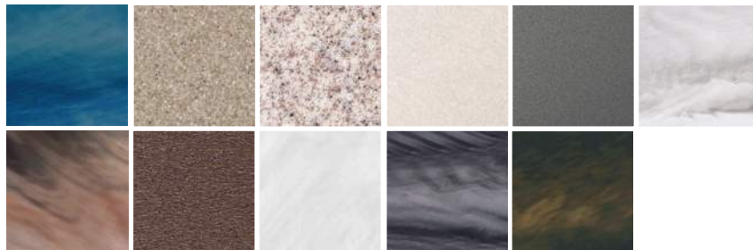
Left to right: Pacific Rim, Desert, Sahara, Gypsum, Winter Solstice, Glacier Mountain, Tuscan Sun, Latte, Silver Marble, Storm Clouds and Midnight Canyon

Your Vita Spa is available in eleven vibrant colors to complement the beauty of its design.