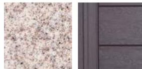
Option 2: Sahara/Mocha